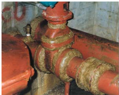
Excellent sealing and molding properties.