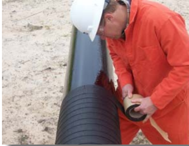
Excellent adhesion to pipe and self.