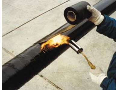
Pipeline rehabilitation and repair.