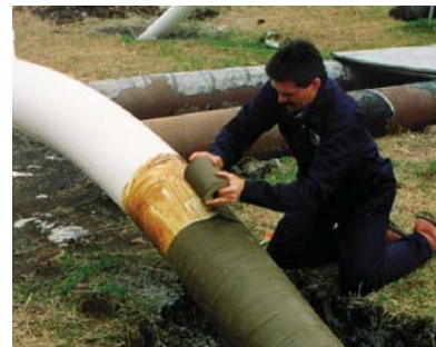
Above and below ground pipe, flanges and valves. Meets AWWA C217 Standard.