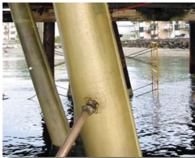
Over 50 year history of proven applications.