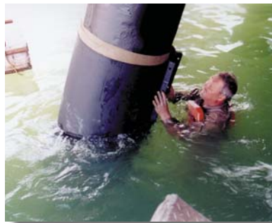
Low cost rehabilitation.