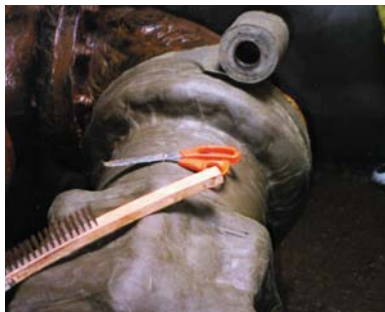
Applied to marginally prepared surfaces (SSPC SP2-3).