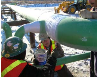
Complete line of liquid coatings.