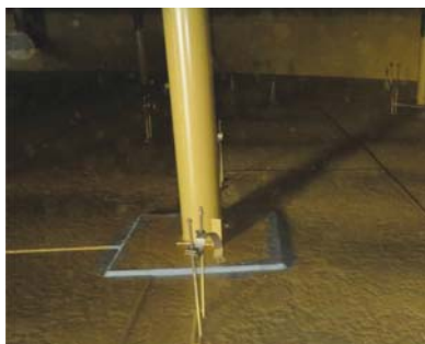
Cures under cool and damp climates.