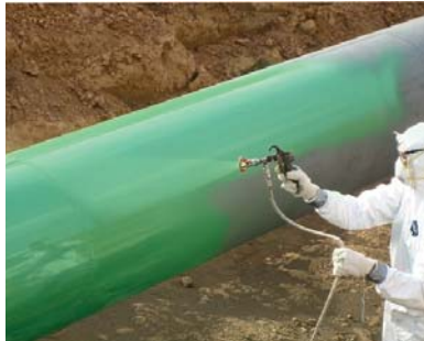
High build (up to 70 mils in one coat).