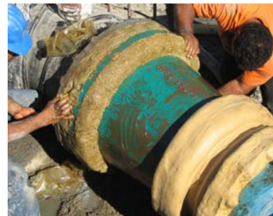
Provides a smooth profile on irregular shaped fittings.