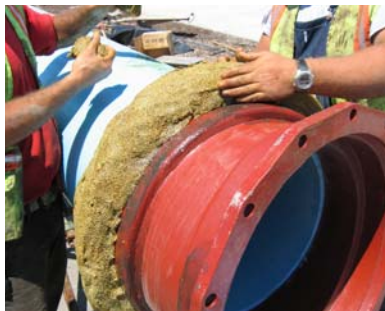
Minimal surface preparation (SSPC SP 2-3).