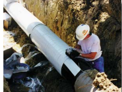
Meets AWWA Standards.