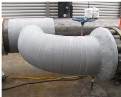
Cooling tower piping, tank bases and pipe under thermal insulation.