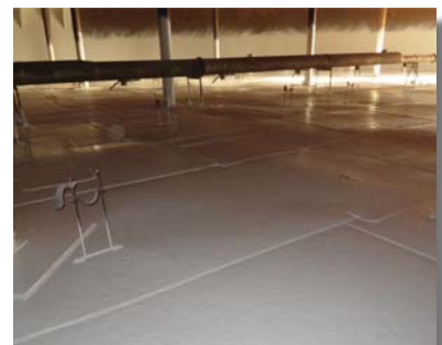
Good flexibility and impact resistance.