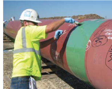
Easy to apply (brush, roller or spray).