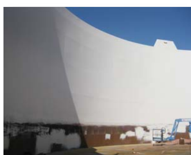
High build up to 40 mils in one coat.