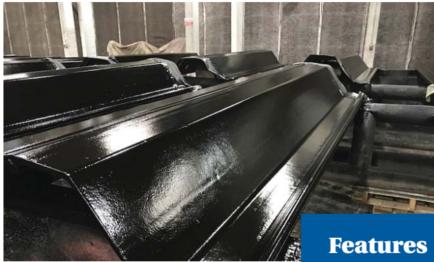
Protal 600 CTE provides long-term corrosion protection to steel sheet piles.