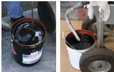
Protal 600 CTE is a two-part high build coal tar epoxy that is applied with a single leg airless unit.