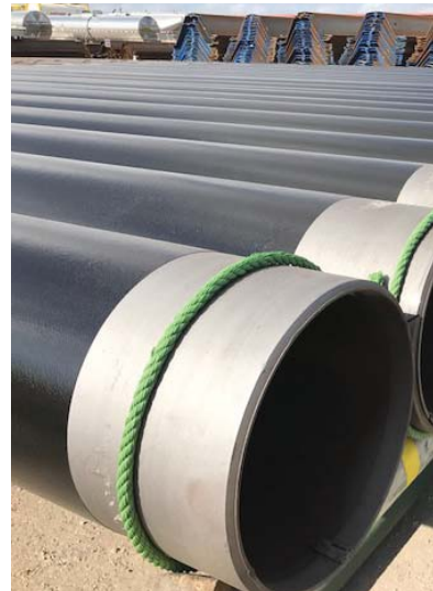
No primer is required when applying Protal 600 CTE.