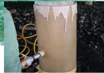
SeaShield 550 Epoxy Grout being pumped into the SeaShield Series 500 Fiber-Form Jacket.