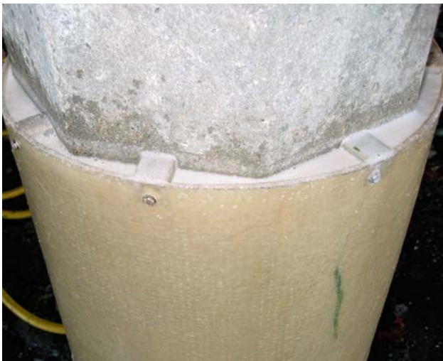
SeaShield 550 Epoxy grout pumped into the annulus around an existing octagonal concrete pile.

For further details please refer to the technical data sheets for the SeaShield Fiber-Form Jacket and SeaShield 550 Epoxy Grout.